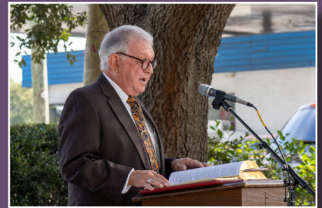
Contract Singers, Guest Musicians & Guest Preachers