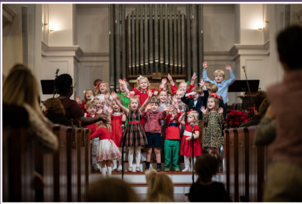
Adult, Youth & Children's Choirs, Handbell & Instrumental Ensembles, and Fellowship Band

As a faith community at MPPC, we come together on Sunday mornings and throughout the year to worship God. We celebrate, praise, and glorify God for all He is and for what He has done for us through preaching, scripture, hymns, and songs. We experience God's presence with us as we are unified in the Body of Jesus Christ. Worship transforms us to a lifestyle of loving God and sharing God's love with others.