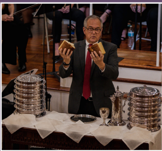
Communion & Special Worship Services