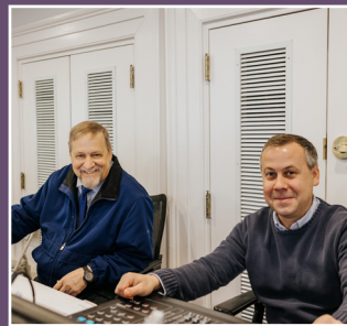
Audio/Visual & Livestreaming