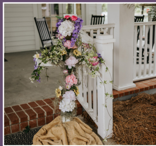
Seasonal Decorating & Sanctuary Flowers