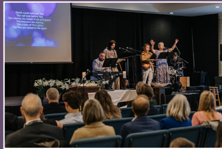
Organ, 7 Pianos, Harpsichord, Fellowship Band Instruments & Choir Robe Maintenance