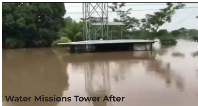
Water Missions Tower After