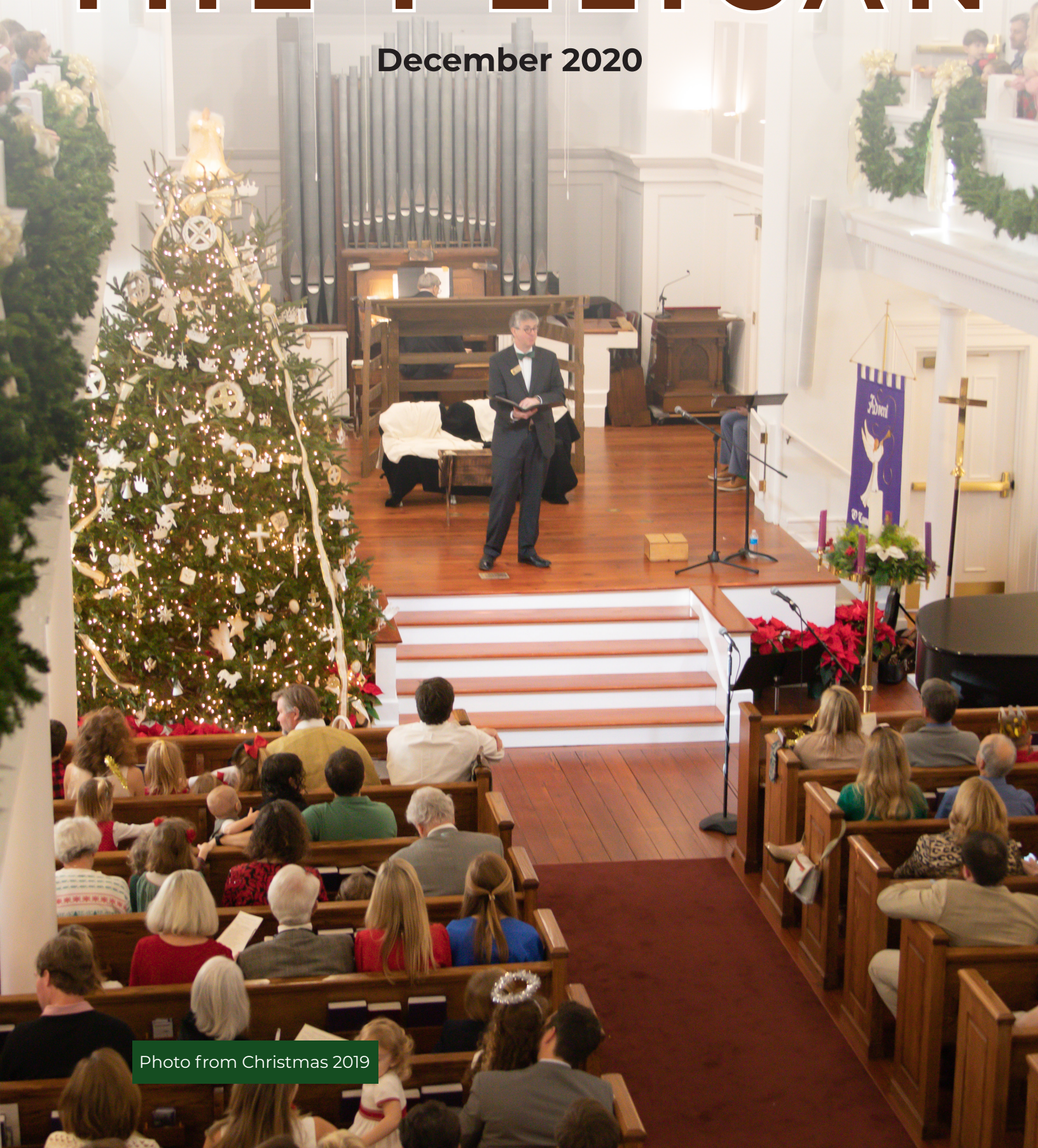
Photo from Christmas 2019