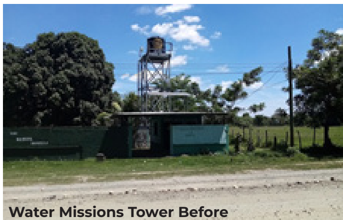
Water Missions Tower Before