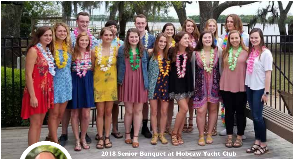
2018 Senior Banquet at Hobcaw Yacht Club