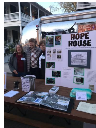
Hope House volunteers share the story of Hope House at the annual Old Village Street Fest event.